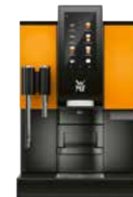
Gloss Burnt Orange