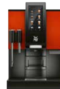
Gloss Hotrod Red