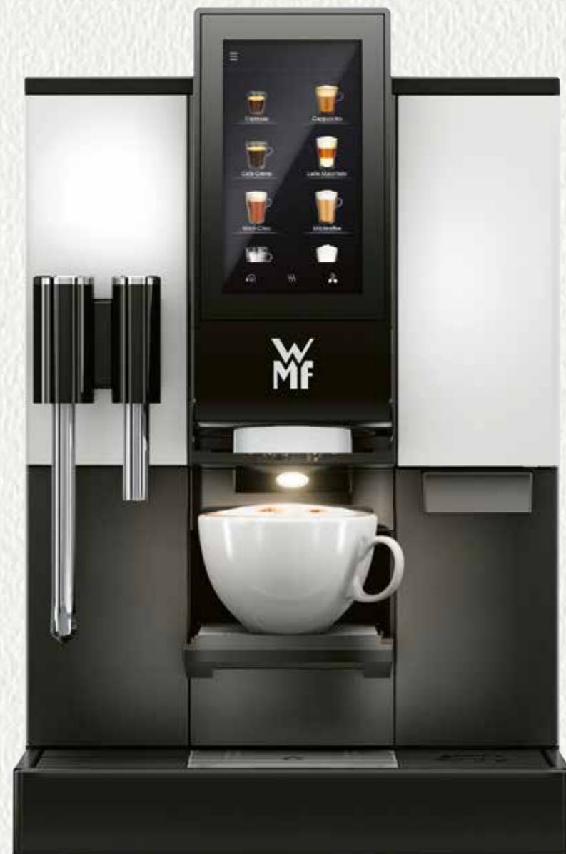
WMF 1100 S with Basic Steam