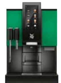
Gloss Kelly Green